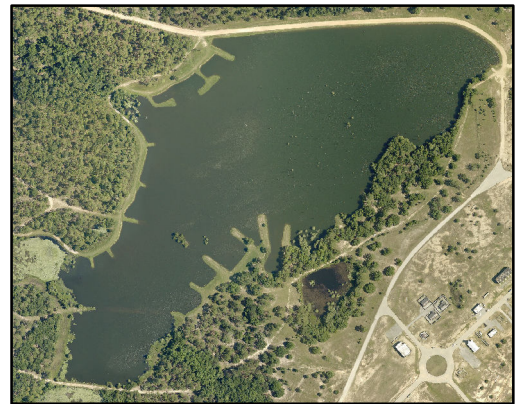
Pond 26 Map Depth in Feet